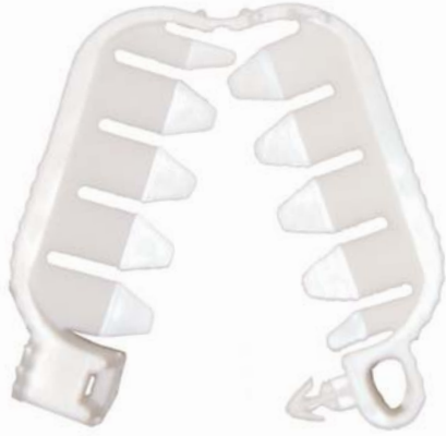
Weasand Clip for Beef - White Part No. 1012147