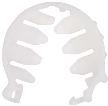
Weasand Clip for Sheep Part No. 1012135