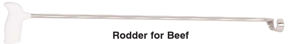
Rodder for Beef Part No. 4021005