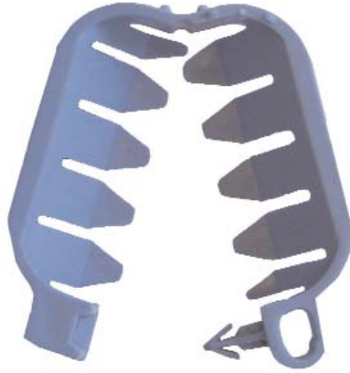
Weasand Clip for Beef - Blue Part No. 1012156