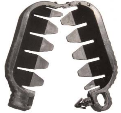
Weasand Clip for Beef - Black Part No. 1012181